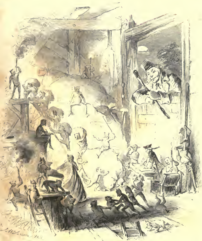
NED. GERAGHTY'S LUCK